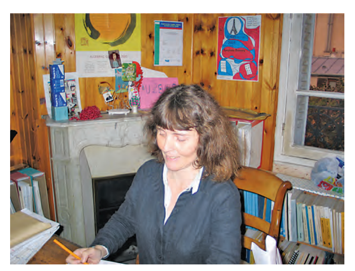
Voisin works in her office at home (2005).

These two results and their proof reflect the deep influence of Claire Voisin's mathematics on me. She taught me, and shows in her papers, that far-reaching and difficult conjectures such as the Hodge conjecture have very concrete geometric consequences and that general motivic results can be leveraged against geometric insight in surprising ways.